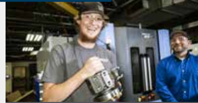
Skilled craft teams focus on perfecting fittings to this critically important technology.