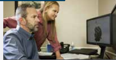
Designing fittings based on real-life feedback from engineers, fabricators and field operators.