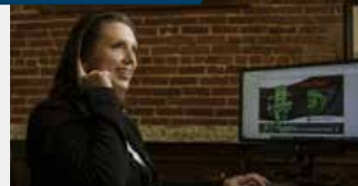
Every call into TMCO is addressed by trained TMCO employees located in regional offices across the US.