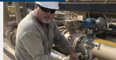
TMCO's after-sales product teams are proud to support the SureShot in the field.