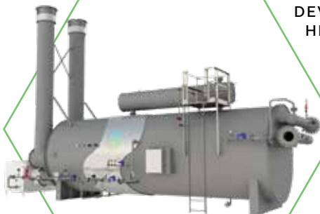
DEW POINT HEATERS