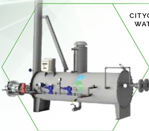
CITYGATE WATER-BATH HEATERS