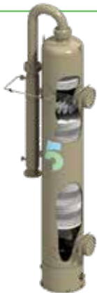
TEG CONTACTOR STRUCTURED PACKING