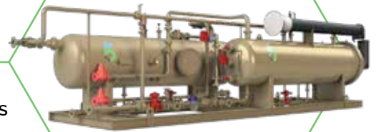
MODULAR SEPARATOR AND TREATER PACKAGES