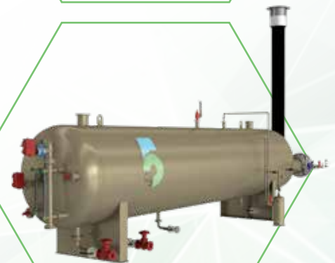
MECHANICAL TREATER PACKAGES