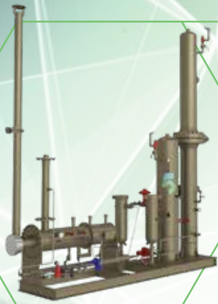
MODULAR WELLHEAD TEG UNITS